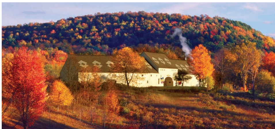
Brewery Ommegang, the unique Belgian-style brewery, will be the host location for the Reunion's Opening Reception on Friday evening, October 11th.

Friday evening we invite local alumni and our guests from out of town to join us for an opening reception at Brewery Ommegang at 6:00 p.m. Located only four miles from Bassett, Ommegang offers an experience that is akin to a trip to Belgium. We will enjoy camaraderie, beer tastings, and light repast at this unique farmstead-style brewery. Some of you might want to join us at Ommegang after attending the Appreciation Celebration honoring Drs.