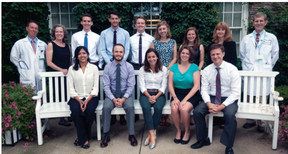
Columbia-Bassett Medical School Class of 2018 with guest presenter from the Guthrie Clinic.