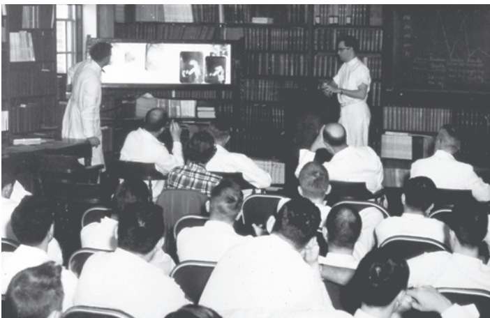
These two historic images depict faculty development opportunities of decades past. Above, a photo of Grand Rounds in the medical library in 1958.