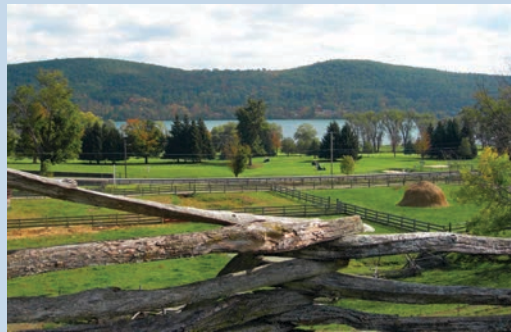
Autumn view of Otsego Lake from The Farmers' Museum

Do you remember the natural beauty, the friendly community and historic atmosphere of Cooperstown? It still retains that charm even though Bassett and Cooperstown's other major institutions have undergone significant changes over the past three decades.