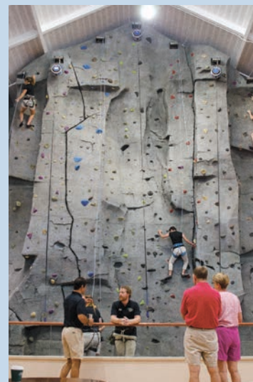
New rock climbing wall at the Clark Sports Center

If you are visiting from out of the area, make your reservation now. Cooperstown continues to offer a wide range of accommodations from the luxury resort to campgrounds. For more information about lodging options, visit the website www.cooperstownchamber.org