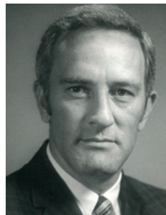
Attending Surgeon in 1971