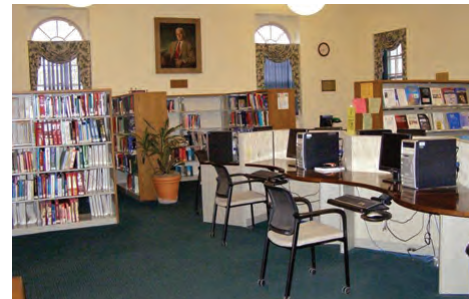
The Mackenzie Medical Library

For those of us who remember the agonies for the patient — and ourselves — even to learn how to do a venipuncture, these new techniques represent an astounding advance, both for teaching skills and also for the actual practice of surgery and other procedures! ■