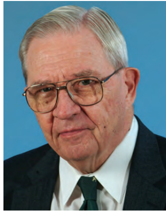
Donald A. (DA) Henderson, M.D.