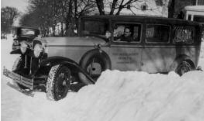
Bassett ambulance, circa 1930. Ah, those Cooperstown winters...

From time to time, we'll present a picture or two to capture an event or people in Bassett's past. Enjoy reminiscing!