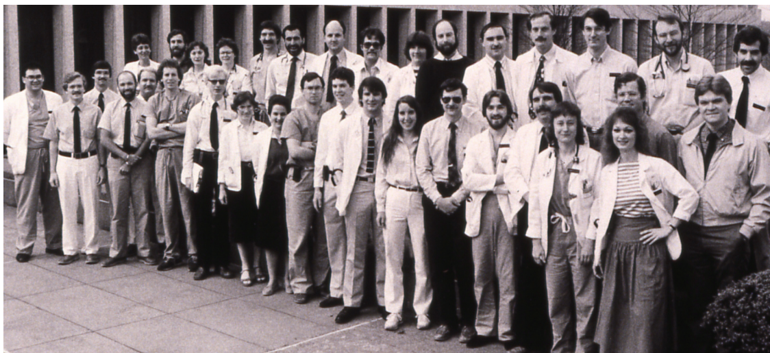
Bassett House Staff 1984-85

Here's a quiz, for some of you at least. How many in this photo of the residents from 1984-85 can you name? Unfortunately, there will be no prize – only a sense of personal satisfaction and hopefully, fond memories! And if you have any short stories to tell, send them to us for the fall issue of The Cupola! You'll find the names on page 8.