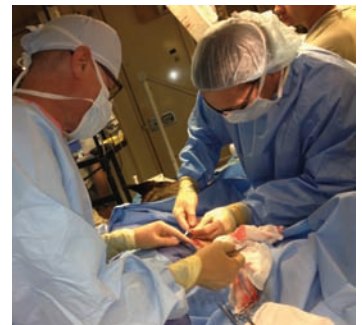
Operation on an Aussie Special Ops dog at a military base near Kandahar