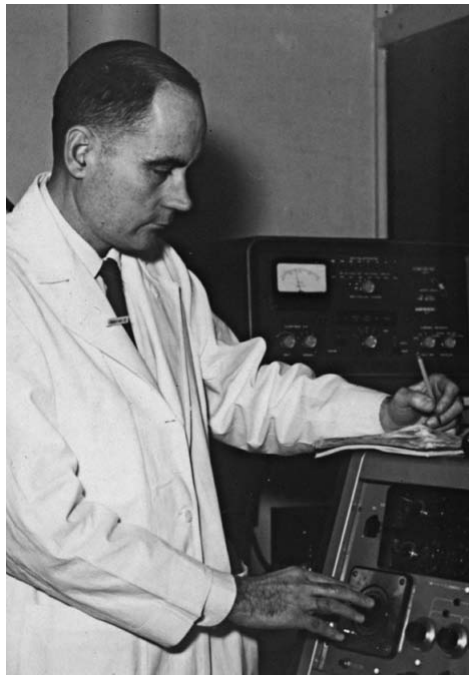
Dr. E. Donnal Thomas in the Bassett research lab circa 1960