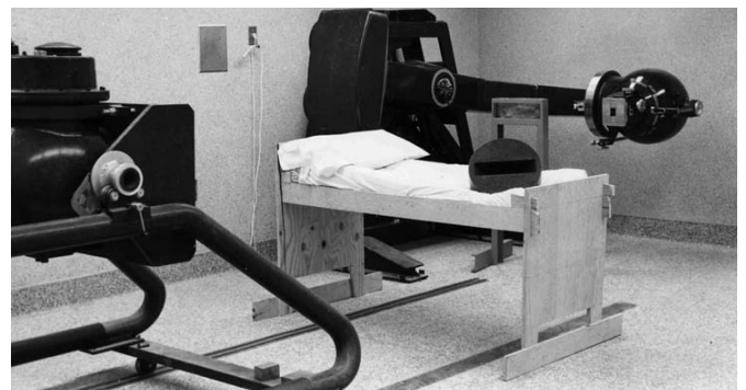
The dual cobalt teletherapy machines used for total-body irradiation, 1958

Please join us in honoring the work of Dr. E. Donnal Thomas and Bassett's 1950s ground-breaking research team with a contribution to the Friends of Bassett using the envelope provided in this newsletter.