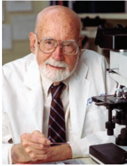
Dr. E. Donnall Thomas, in his Hutchinson Center lab

E. Donnall Thomas, M.D. 1920-2012, was Bassett's Physician-in-Chief 1956-63.