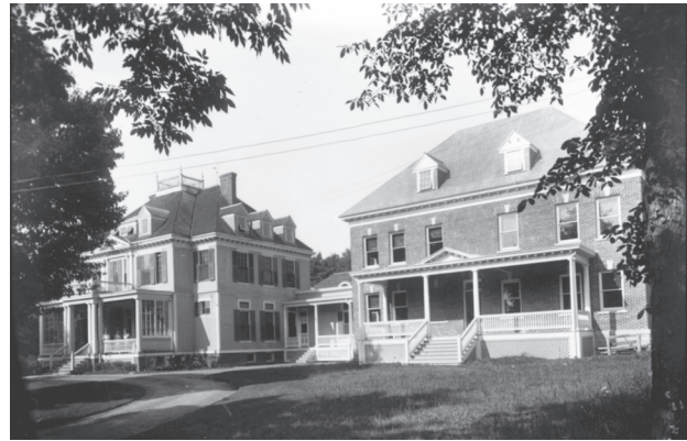
First opened in 1896, Thanksgiving Hospital served as a hospital until 1922.

As the flu epidemic ebbed, Cooperstown and Bassett Hospital stepped up to serve a role in the care of World War I pilots. The Village Club and Library (now Cooperstown Village Hall), and the finally completed Bassett Hospital were used by the U.S. Government to treat "nerve-shocked" WW I aviators, before the hospital finally opened to the public in 1922. John Barry's The Great Influenza (Penguin Books, 2005) chronicles the pandemic, and many other reviews are easily found, such as an October 7, 2020 piece in Time magazine: time.com/5894403/how-the-1918-flu-pandemic-ended/ . ■