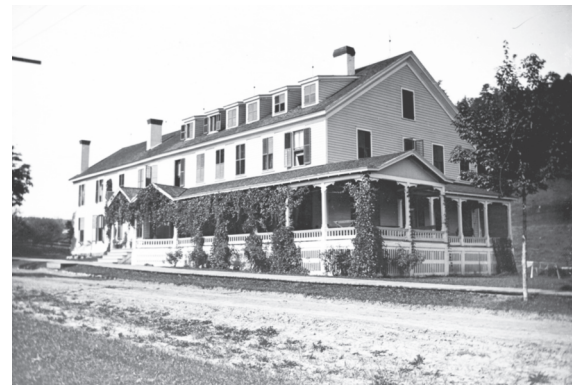
Otsego Hall also housed flu patients as the hospital reached capacity.