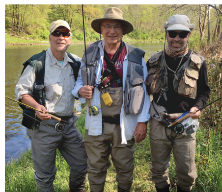
Three doctors enjoying a day fishing in the Catskills